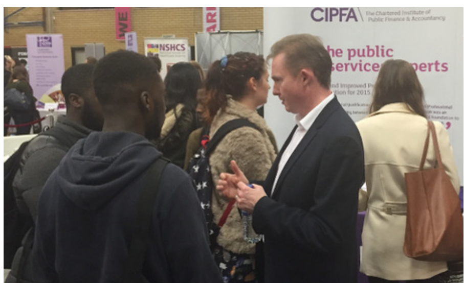
CIPFA's stand always attracts lots of student interest