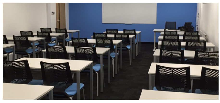
...and after the refurbishment