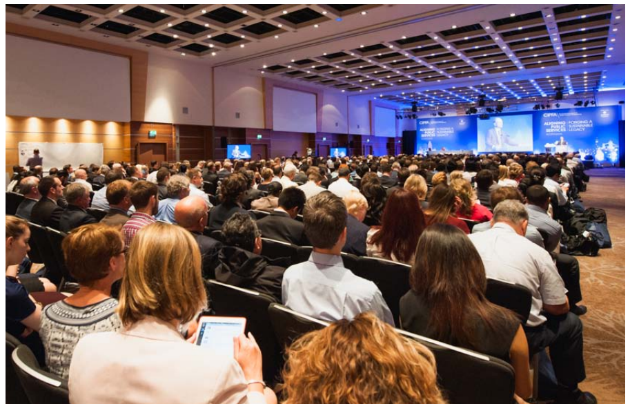
Expect a high level of debate at this year's conference just weeks after the EU Referendum

Against a backdrop of tightening budgets, global economic instability and the aftermath of the EU Referendum, public finance leaders