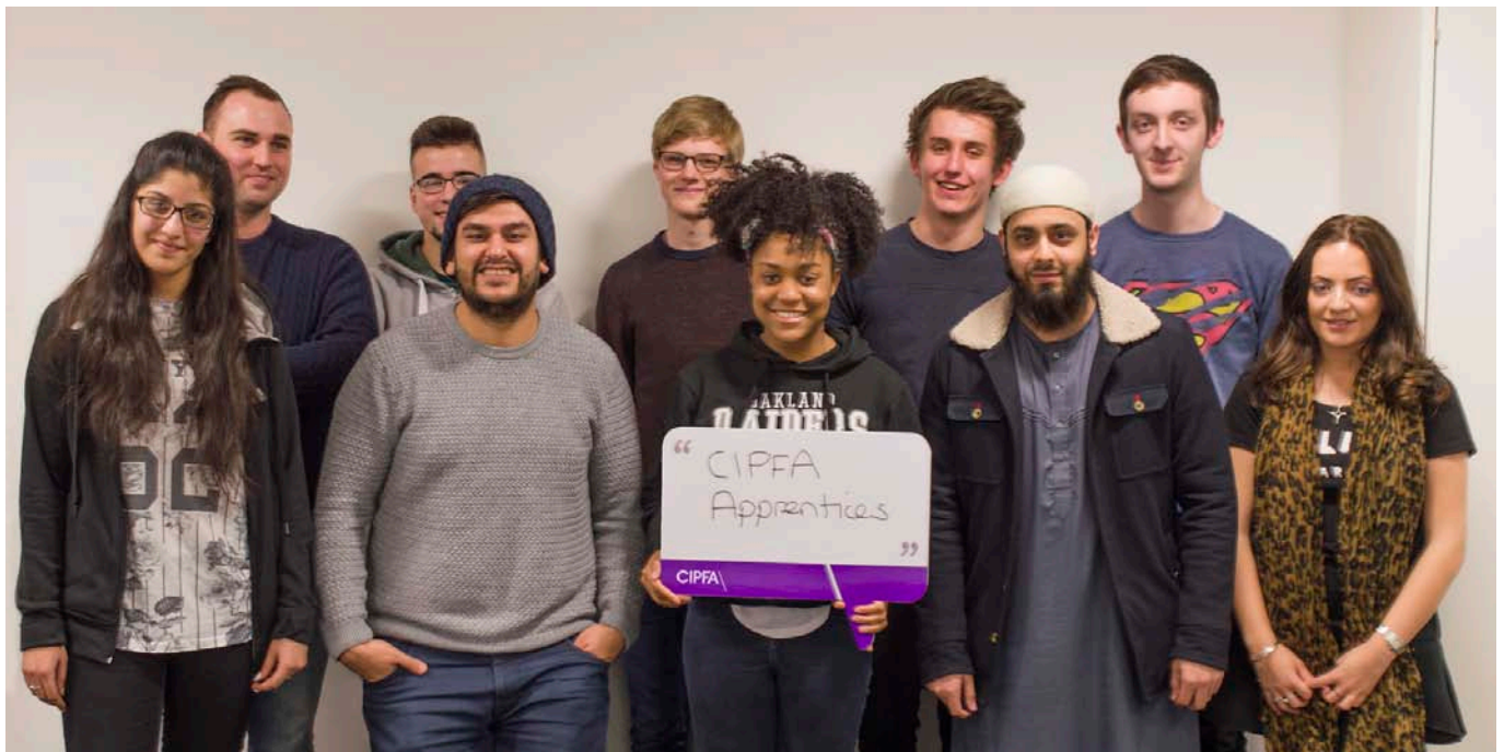
Our current group of apprentices complete their placements this summer

The third cycle in CIPFA’s scheme to nurture top talent in the public sector through accountancy apprenticeships continues to build momentum after its launch two years ago.