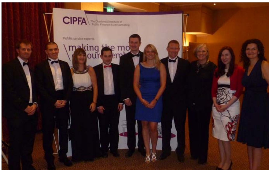
CIPFA North West welcomes its new members