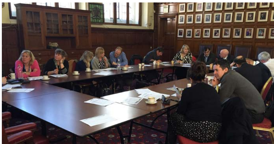
Health and social care integration at work in Bradford training session

CIPFA’s Integration training has been designed to improve mutual understanding of the issues, drivers and flexibilities of the two sectors, so that rather than being seen as a blocker finance professionals can help lead discussions and planning for service integration. Working with teams in local economies has the dual benefit of increasing skills whilst at the