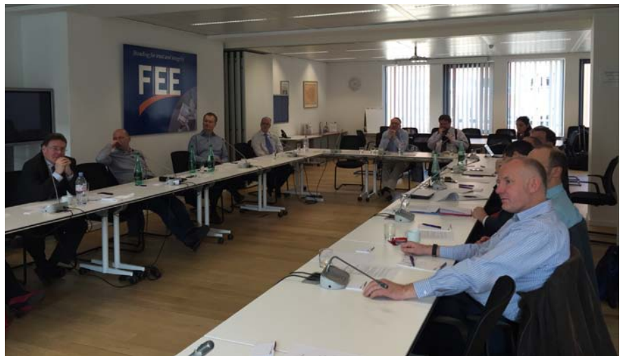
Members of CIPFA Europe met up in Brussels in March for a seminar and AGM.