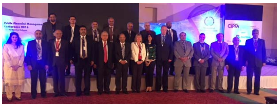
Expert speakers from Pakistan and CIPFA at the PFM conference