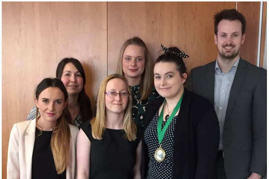
Members of NW CSN are hosting an evening reception on 13 July for all students at this year's annual conference

Building on a successful year, the NW CSN plans to actively engage students in many more regional events in 2016. We are particularly excited that the CIPFA Annual Conference is being held in Manchester. Students can look forward to an evening reception hosted by the NW CSN where students from all regions are invited for an opportunity to network and share student experiences.