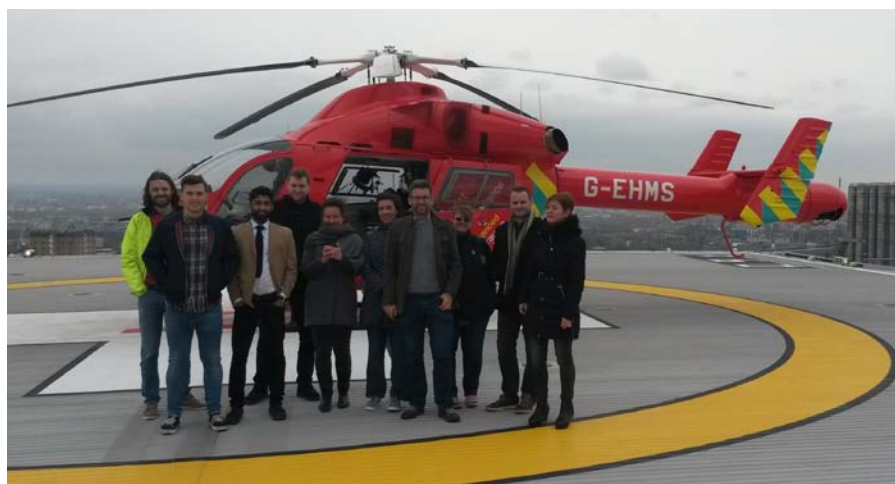
CIPFA staff were invited to view the London Air Ambulance's helicopter on the roof of the London Hospital in Whitechapel, and hear about their £6m fundraising target.