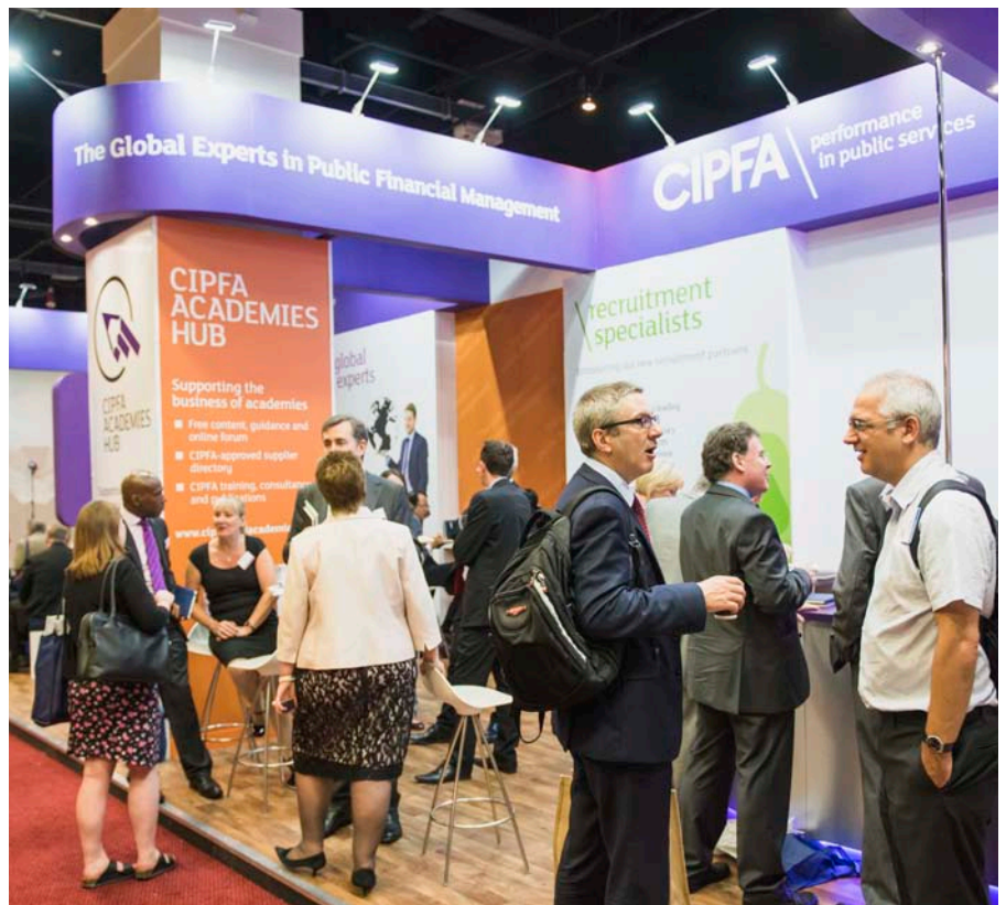
Students get free admission to the annual conference

A special offer two-day conference ticket for students is also available for £90 +VAT. The discounted ticket allows students to benefit from the full conference experience with recommendations from CIPFA on key sessions of interest to students. Visit www.cipfaannualconference.org.uk for further information and book your ticket.