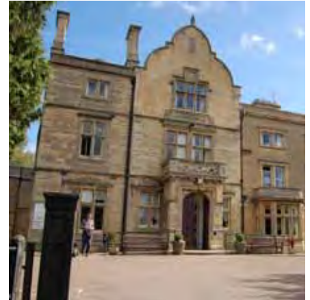
Knuston Hall will host the CIPFA South East summer school

For details, prices and to book online visit the CIPFA events webpage . For any booking that includes overnight accommodation or attendance at the evening sessions, please email summer.conference@cipfasoutheast.org.uk