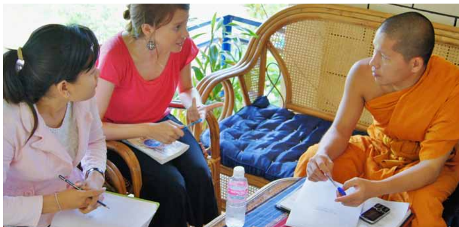
An AfID volunteer mentors local staff at Life and Hope Association, Cambodia

For other volunteering opportunities with CIPFA, visit http://www.cipfa.org/about-cipfa/volunteers .