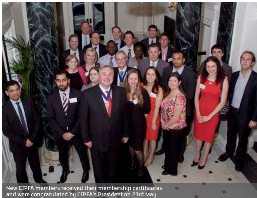
New CIPFA members received their membership certificates and were congratulated by CIPFA's President on 23rd May