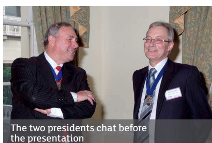
The two presidents chat before the presentation