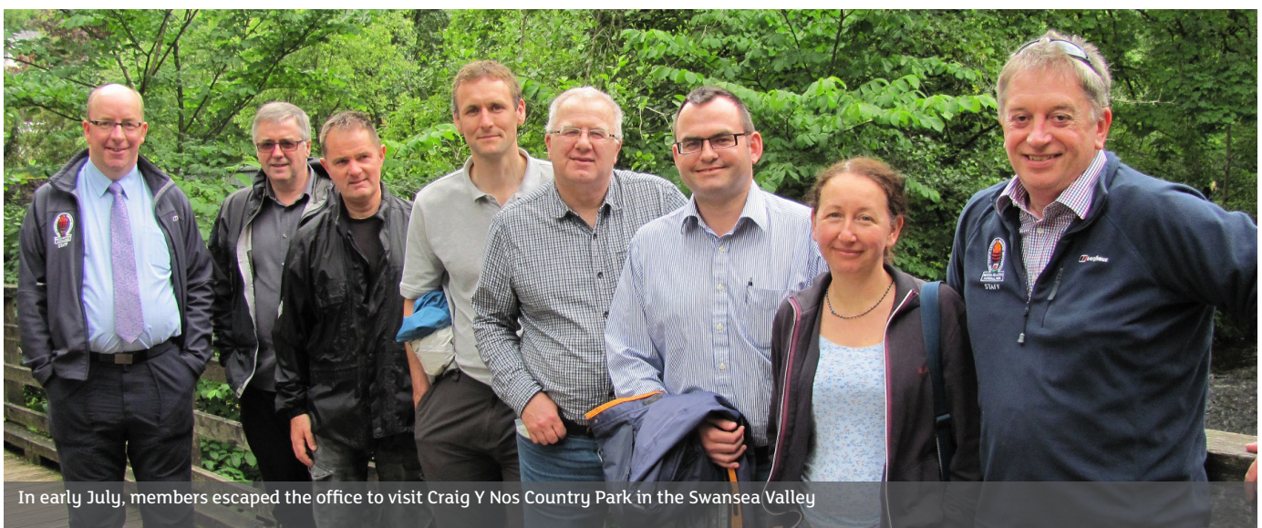
In early July, members escaped the office to visit Craig Y Nos Country Park in the Swansea Valley

All events can be found on, and booked via, our CIPFA Cymru-Wales website.