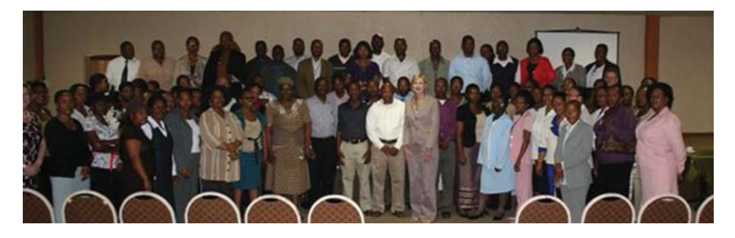
CIPFA | Spreadsheet magazine | JUNE 2009

We then moved onto South Africa, where CIPFA has a joint venture with the Institute of Public Finance and Auditing (IPFA). In Pretoria we encountered a very different economic environment. South Africa is well on course to meet the Millennium Development Goals before 2015. The country is